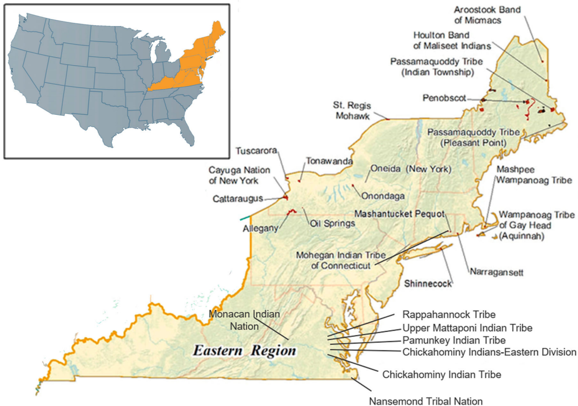
Figure 1. Northeastern and Mid-Atlantic Tribal Nations.

The map depicts the federally recognized Tribal Nations in the northeast and mid-Atlantic regions. However, not listed are state recognized Tribes, federally recognized Tribes with historical ties to the region (but due to colonization no longer have land holdings in the region), and other non-reservation Indigenous communities including urban Indigenous communities all of which have a range of potential associated water security climate change impacts due to SLR. The map is adapted from the Northeast Climate Science Center Tribal Partners programme ( https://necsc.umass.edu/indigenous-peoples-and-tribal-partners ).